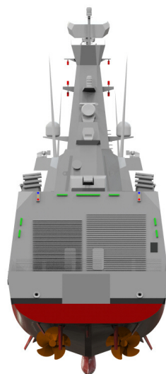
BORA Class FRIGATE 105 www.taishipyards.com